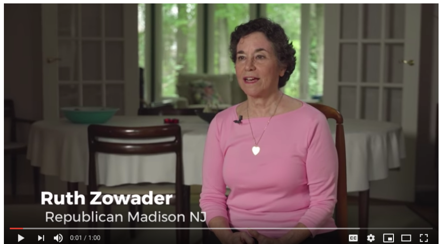
Republican Woman on Why She's Supporting Mikie Sherrill